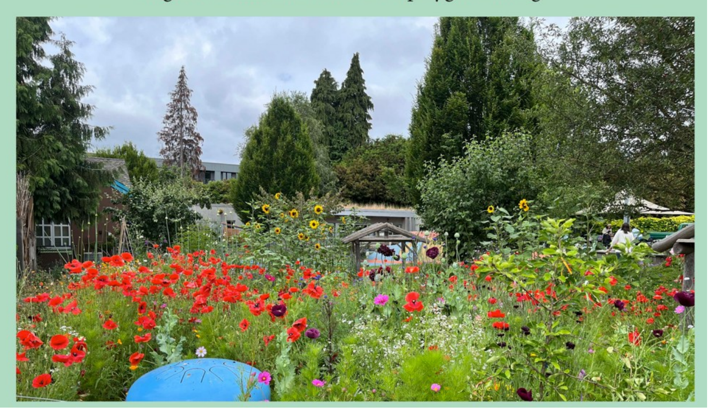
Our Rotary Club has funded several Community Service projects on behalf of the PlayGarden.

Register online at www.seattleplaygarden.org